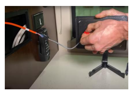
Insert USB Flash Drive