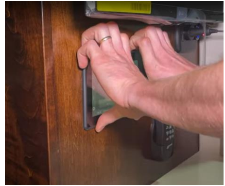
Place fingers on top edge of Touch Screen and apply pressure down and out