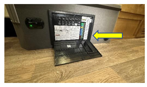
Open Fuse Panel and Locate Awning Fuse