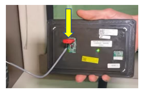
Remove USB Flash Drive