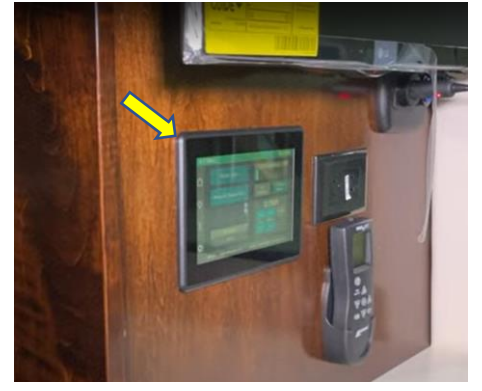
Locate Touch Screen