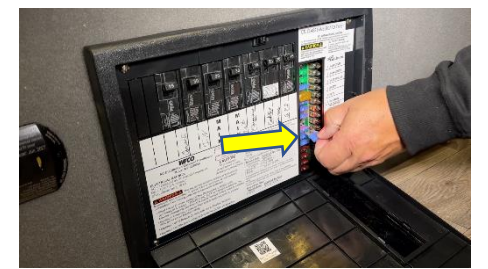
Remove Awning Fuse From Fuse Panel

Note: Step One (fuse removal) should be completed <u>immediately</u>, and the fuse left out to prevent unintended awning activations - until the software update has been completed.