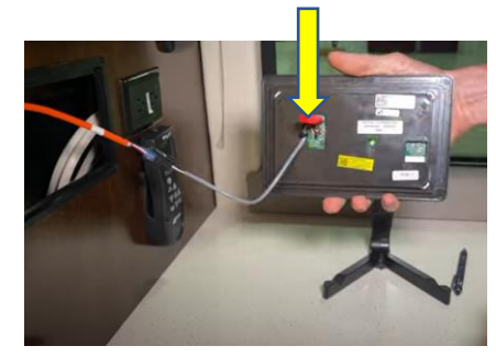
USB Flash Drive inserted

• Insert USB Flash Drive into USB port on the rear side of the Touch Screen.