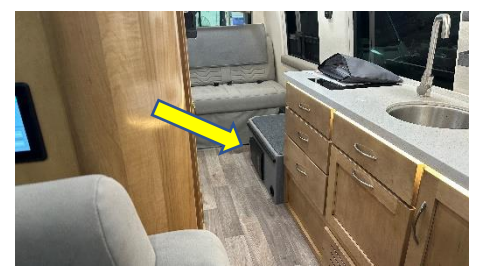
Locate Fuse Panel