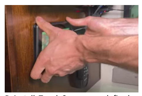
Reinstall Touch Screen – push firmly in place