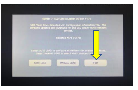
Tap the second update