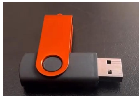
USB 2.0 Flash Drive (typical)

Supplies needed to complete the software update will be a USB flash drive.