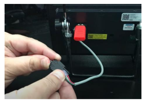
Disconnect power for 5 seconds