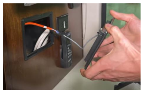
Reinstall Touch Screen in its mount