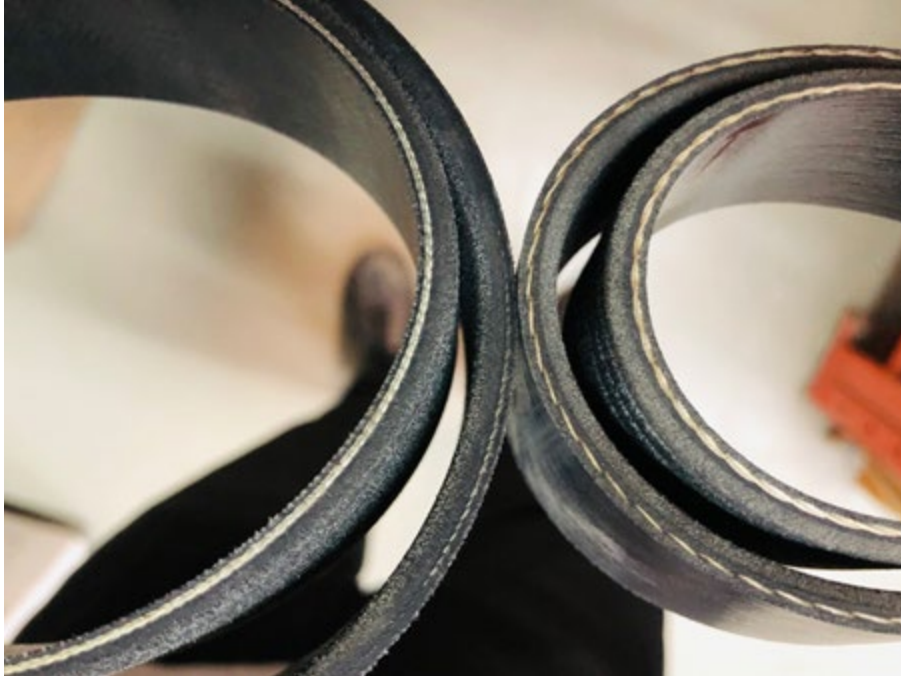
Defective Aramid cord reinforced belt (left) vs New polyester cord belt (right) – Note the different cord arrangement between the two belt types.