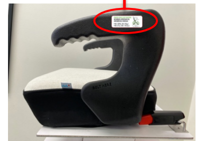
Figure 3 - Placement of Remedy Kit Label