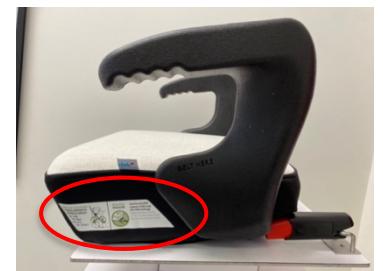
Figure 2 - Missing Label