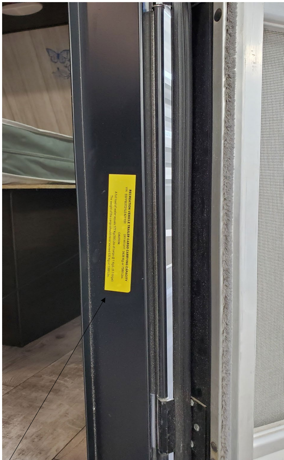
Section 3 – Cargo capacities applied to the inside of the door jamb.