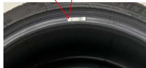
Figure 2 : Serial number stickers overview

6.1.2. Open a technical ticket to provide all needed information mentioned above.