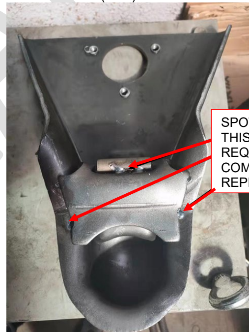
FIGURE 2 (BAD)

SPOT WELDS LIKE ON THIS COUPLER WILL REQUIRE A COMPLETE COUPLER REPLACEMENT.