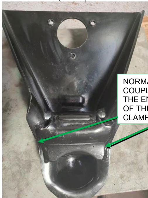
FIGURE 1 (GOOD)

NORMAL WELDS ON COUPLER UP THE ENTIRE LENGTH OF THE BOTTOM BALL CLAMP