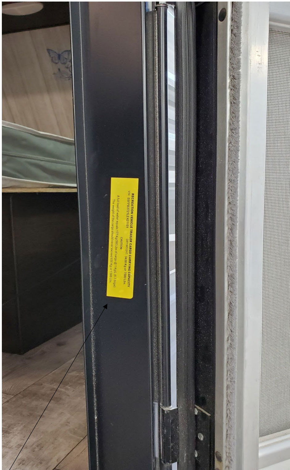
Section 3 – Cargo capacities applied to the inside of the door jamb.