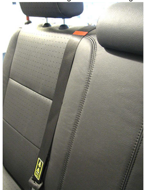
4. The Retractor is unlocked.

3. Retract the achieved amount of webbing to allow unlocking of the locking mechanism.