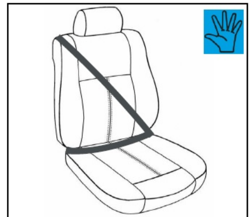
Closing three-point belt