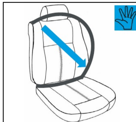
Pulling out belt strap