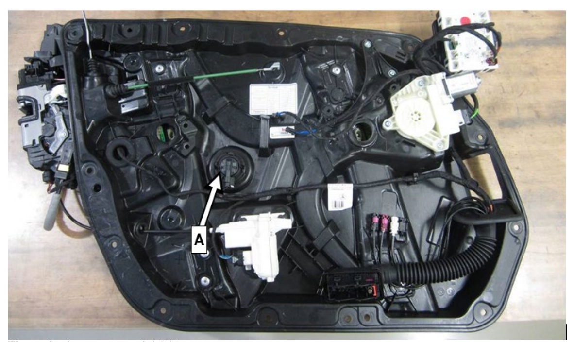
Figure1, shown on model 213