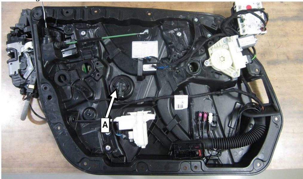
Figure 1, shown on model 213