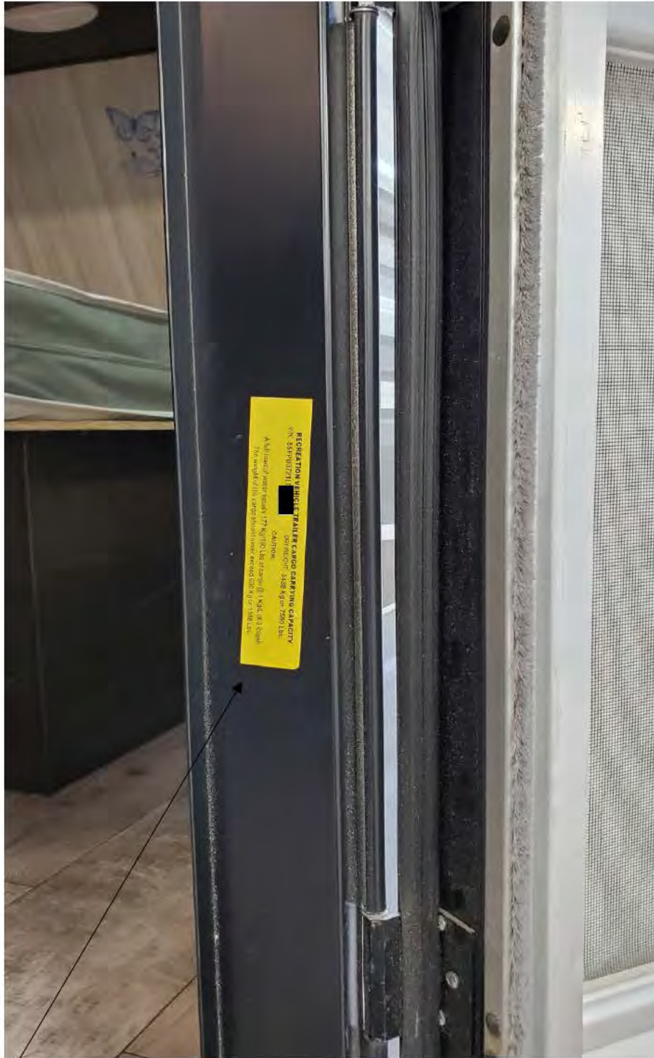
Section 3 – Cargo capacities applied to the inside of the door jamb.