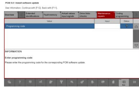
Entering PCM 6.0 programming code

Once the update has started, the PCM is restarted in the Update menu and the individual components are then updated.