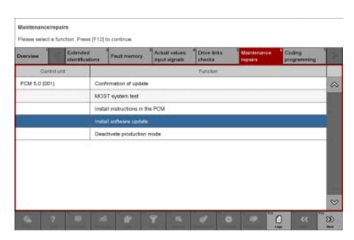
Installing PCM 6.0 software update