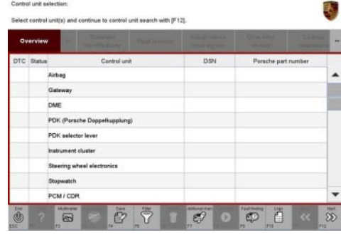
Control unit selection

Mark the vehicle analysis log you have just created with the attribute "Final VAL" and after carrying out the campaign, return it using the PIWIS Tester.