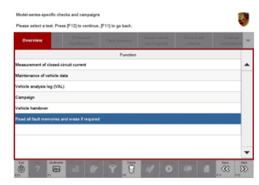
Erasing fault memories

If control units are found to have faults that are not caused by control unit programming,