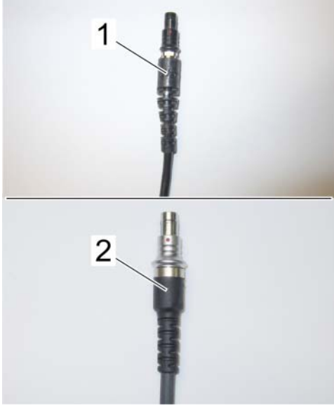
PIWIS Tester data cable

A discrepancy may arise with later software versions for example.