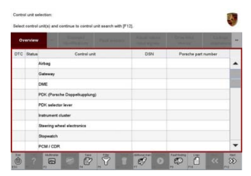
Control unit selection

Mark the vehicle analysis log you have just created with the attribute "Final VAL" and after carrying out the campaign, return it using the PIWIS Tester.