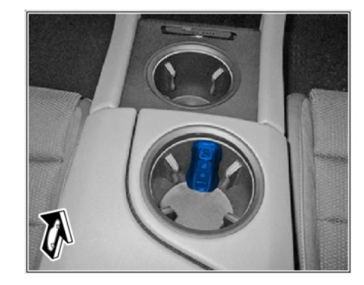
Emergency start tray