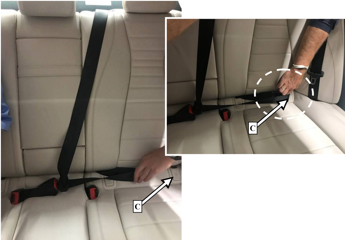
Figure 3, model 213

i Forming a loop is not required with model 463.