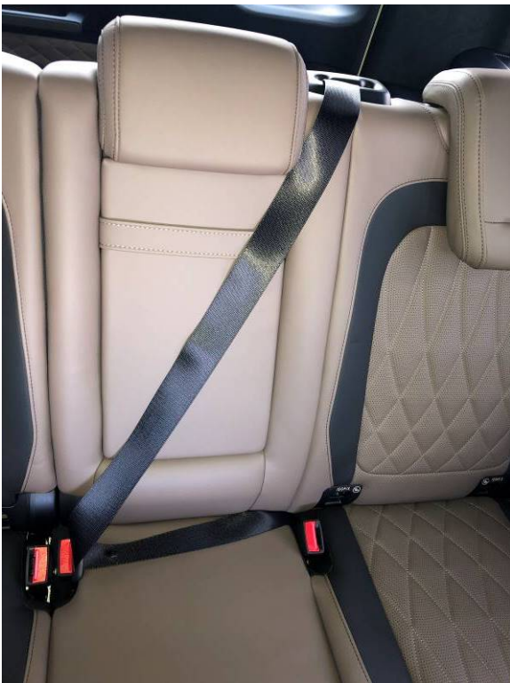
Figure 5, model 463

10. Pull the seat belt webbing until the entire length has been completely spooled out of the inertial reel, up to end stop.