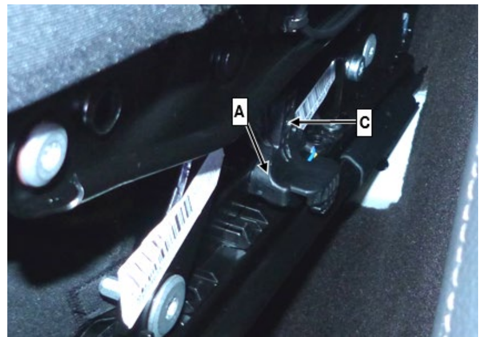
Figure 1 (shown on right front seat)