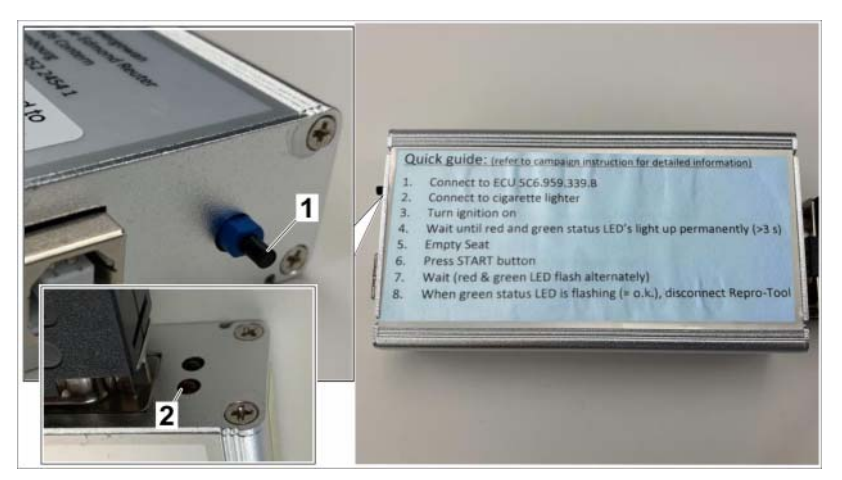
Re-programming control unit