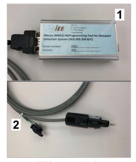
AMA2 programming box

and working time must be invoiced in the campaign claim for the remaining vehicles on which work is carried out as part of this campaign at the Porsche dealer.