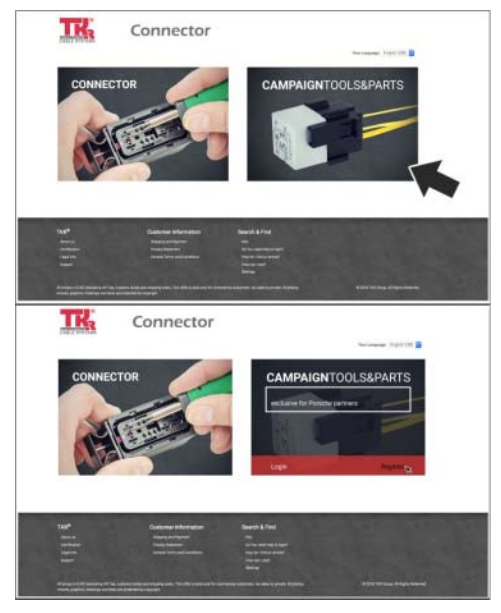
TKR Automotive GmbH online shop

For more information about using the online shop, see: https://ppn.porsche.com/portal/community/porsche_cars_north_america/after_sales/service/specialtools-and-equipment/blog/2021/09/22/ama2-recall-campaign-ordering-the-tkr-programming-box.