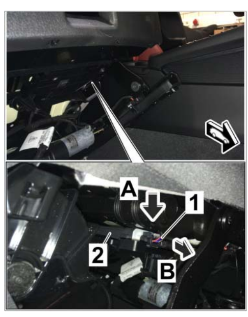
Re-programming control unit