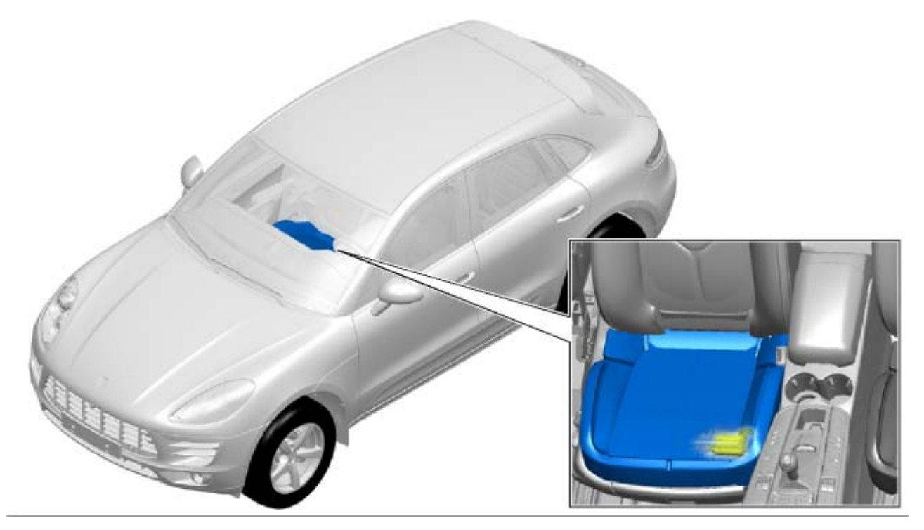
Installation position of seat occupancy detection system for passenger seat