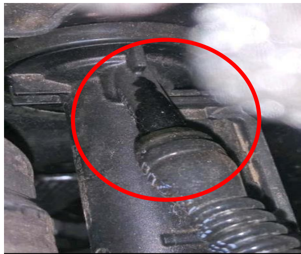
SAMPLE of Leak/Seepage