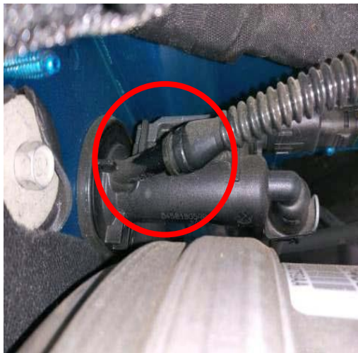
SAMPLE of Leak/Seepage