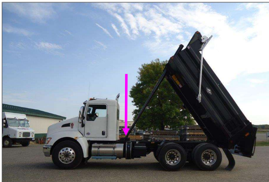
Location of the hoist cylinder cradle mount pin when viewed from the driver's side of the work truck.

Marathon cylinder attachment to the chassis hoist cradle pin. See images below illustrating the location to check.