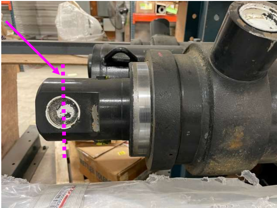
Rod end of cylinder shown with example of indication of potential failure zone.