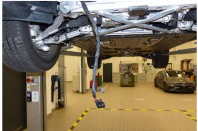
(Routing in protective hose)