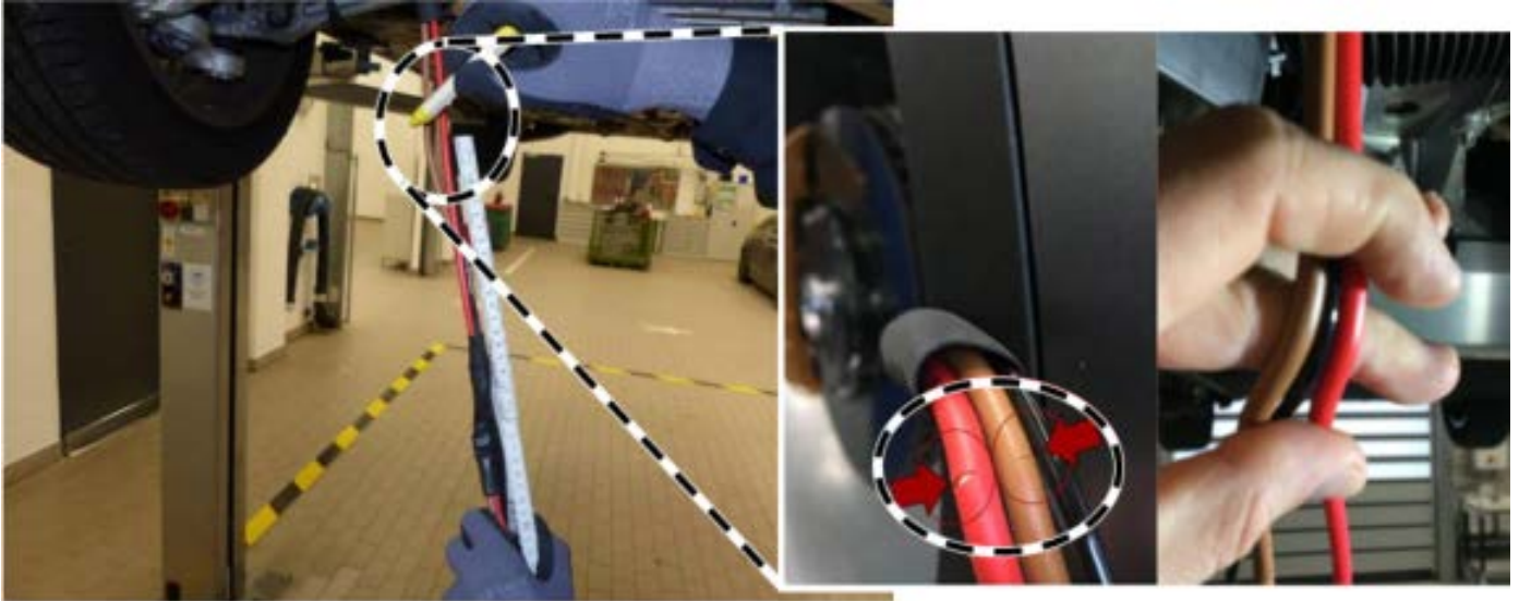
Figure 2 (NOT OK)

i The red power supply cable and brown ground cable may not be damaged.