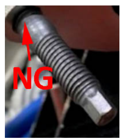
*If any of the studs or nuts cannot be reused due to damage, replace them with OEM studs (ML296164) and nuts (ML296165).

4. Install new gaskets (ML296166 and ML296167) on the manifold flanges and connect the exhaust front pipes.