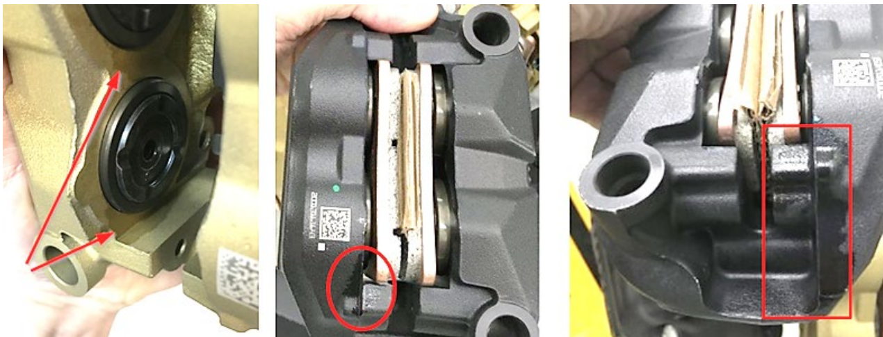
Figure 1: Examples of Staining or Leaking:

If the brake calipers are to be replaced, the following steps must also be completed: