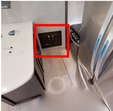
FIGURE 1 – LOWER CABINET

NOTE: THE LOWER CABINET INSERT IS 12" IN DEPTH. TO ALLOW FOR THE PROPER RELOCATION AND INSTALLATION OF THE FURNACE, A NEW CABINET NOW 7" IN DEPTH WILL BE INCLUDED IN THE KIT TO RELOCATE THE FURNACE.