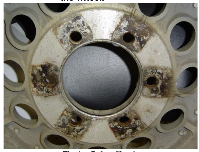
Fig. 1 Before Cleaning

Do not allow solvent or equivalent to make contact with the tire. Do not use liquid paint remover as this will pit and damage the aluminum wheel. Do not use a wire wheel (brush) or grinder to remove the paint from the wheel as this will also damage the wheel.