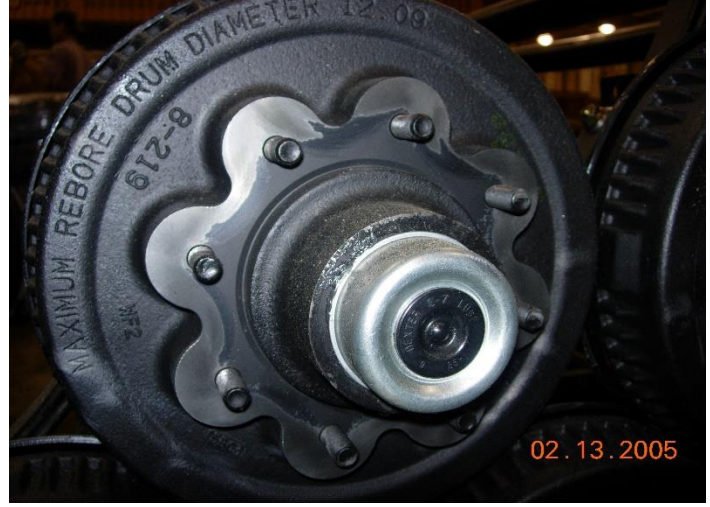
Fig. 3 Before Cleaning