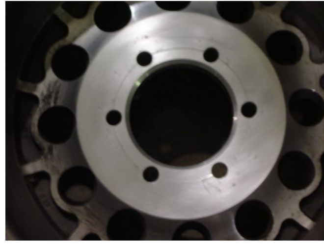
Fig. 2 After Cleaning