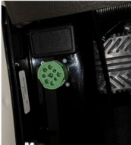
Figure 1, 9 pin connector on truck