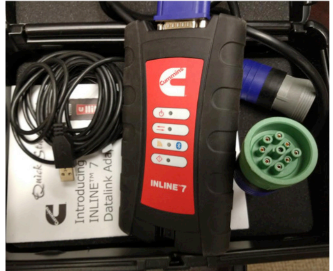
Figure 2, Inline 7