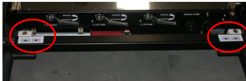
Locks large manual handrails