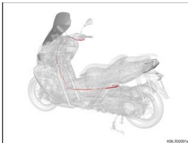
Figure 1: Routing of throttle cable

When riding in outside temperatures below freezing, this can lead to stiff movement up to the complete freezing of the throttle cables, and lead to a critical riding situation.