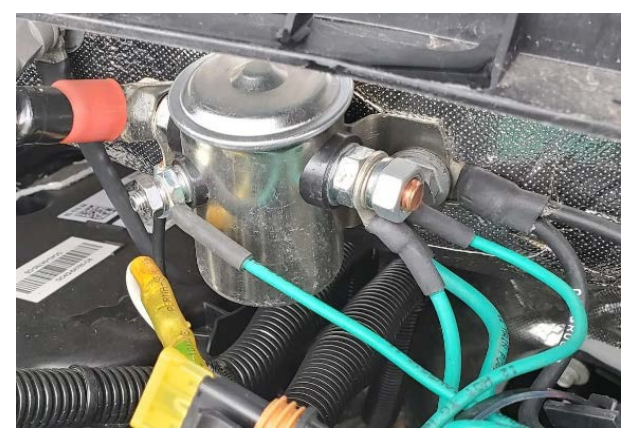
Incorrect: 3-Post Solenoid

It is the installer's responsibility to ensure all OEM chassis equipment, body and/or products are not damaged during set-up or installation.