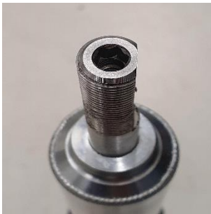
Recalled Part no marking

(c) Products You Installed or Sold to Consumers: You must immediately check your sale records to identify any consumers to whom you sold the recalled product and provide that information to the Warranty Department of Öhlins USA at 1-800-336-9029 or ohlins_us_info@driv.com , so that we may notify them of this recall. As it is not possible to determine whether an installed strut has experienced excess stress during its life, consumers will receive a replacement front strut free of charge, along with a new top mount interface solution that will resolve the incompatibility. The new, replacement strut will be either Part No. POS 5N20 or POS 5N21, which are interchangeable. (Replacement Part No. POS 5N20/21 struts will be uniquely and permanently marked to distinguish them from the recalled POS 5N20 parts.)