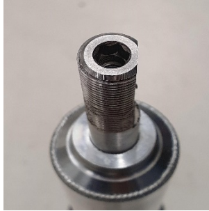
Recalled Part no marking