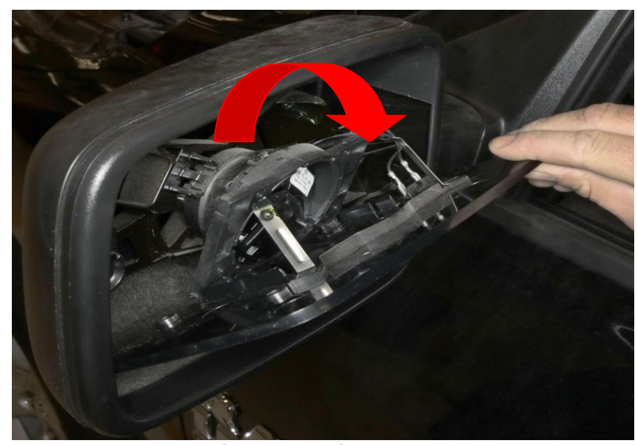
Figure 2 - Mirror Glass

2. Firmly and carefully grasp the mirror at the top and pull out to separate the upper mounting clips (Figure 2).