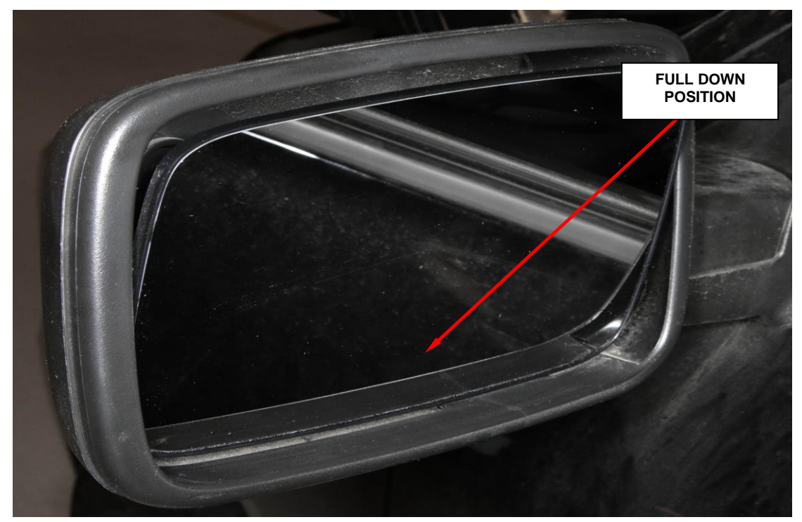
Figure 1 - Side View Mirror Assembly

1. Move the mirror into the full down position (Figure 1).