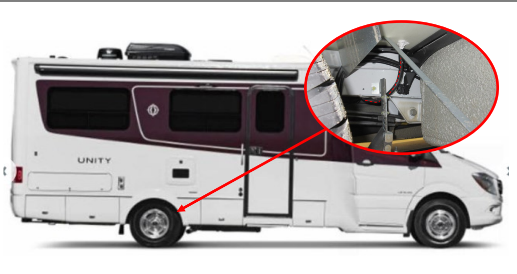
Locate where the water heater's copper propane line, runs through the coach floor just in front of the PS rear wheel.

Department: Warranty/Service People Required: 1 Time to Complete: 7min Date Created: Dec. 4, 2019 Date Revised: Rev #: Created by Initial: GK806 Verified: