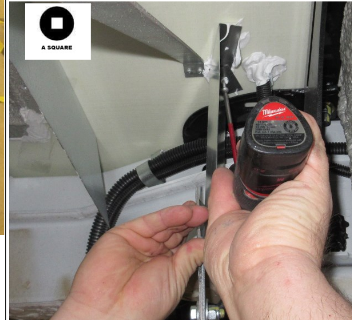
With the narrower side touching the front of the top muffler bracket flange; fasten each (2) shield flange to underside of floor with a #10 x 3/4" Robertson (square) Pan Head SS Screw (141-0204)