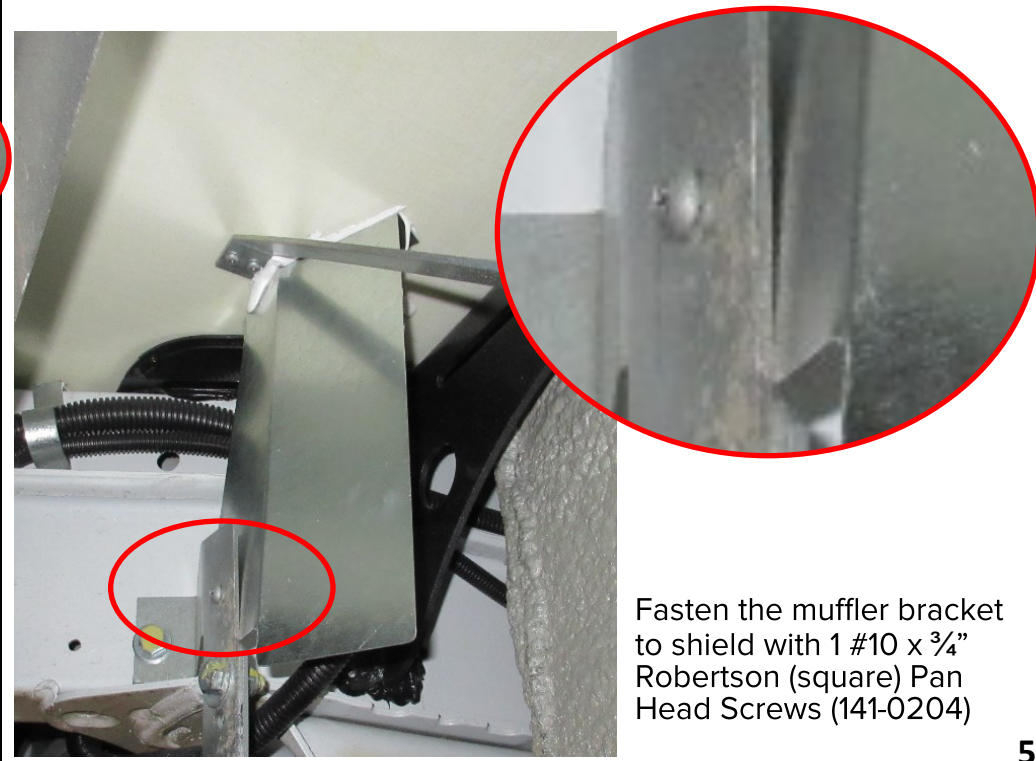
Fasten the muffler bracket to shield with 1 #10 x 3/4" Robertson (square) Pan Head Screws (141-0204)