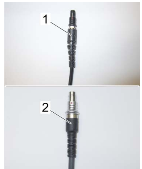
PIWIS Tester data cable

The vehicle type is then read out, the diagnostic application is started and the control unit selection screen is populated.