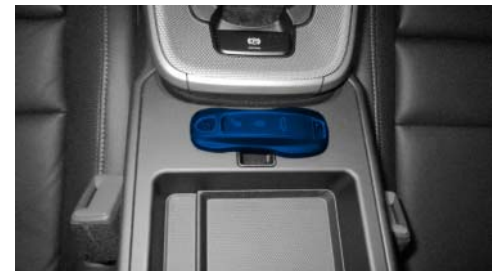
Emergency start tray

2 Place the driver's key with the back facing down in the area in front of the storage compartment under the armrest ( emergency start tray ) in order to guarantee a permanent radio link between the vehicle and driver's key ⇒ Emergency start tray .