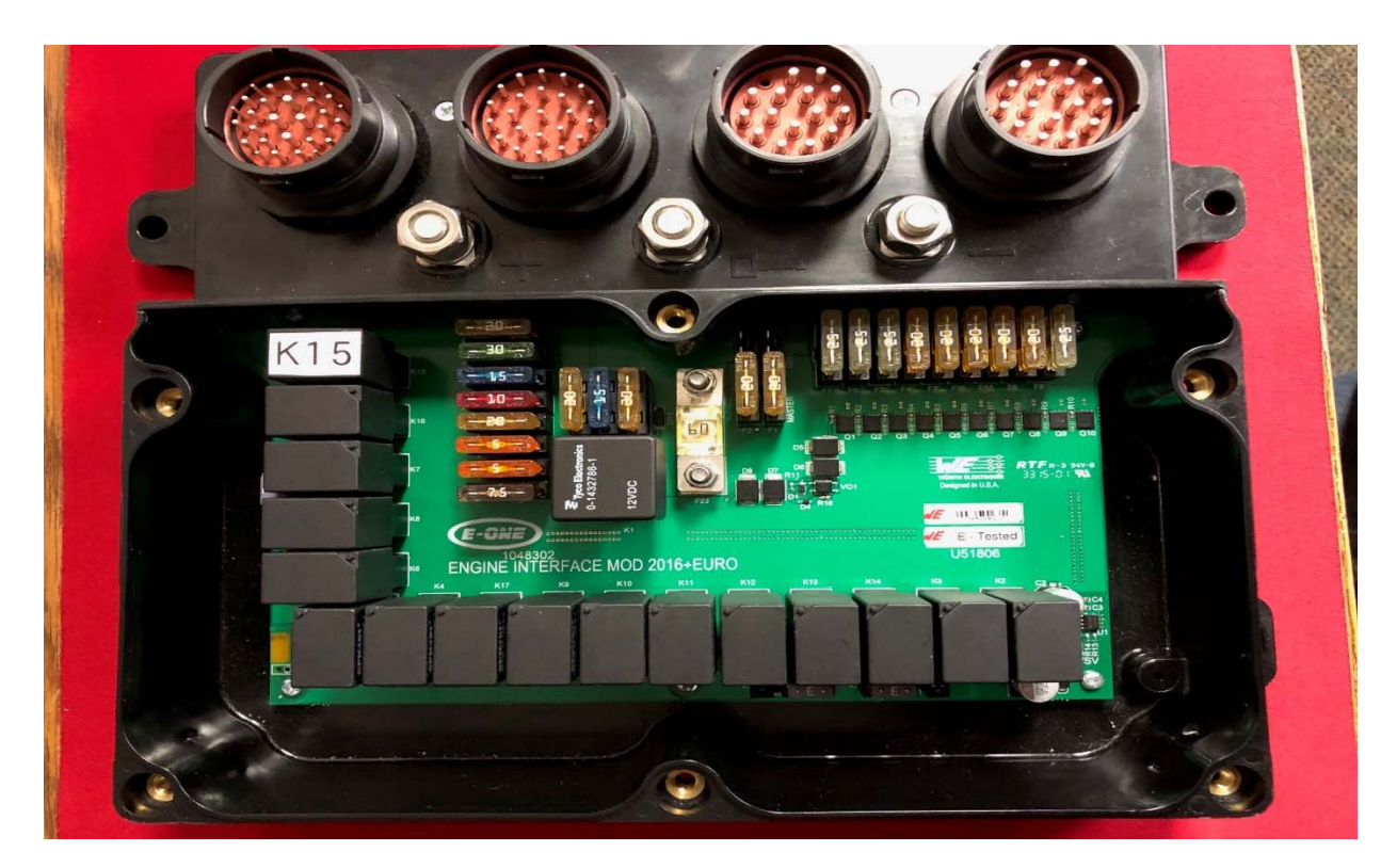
Figure 3 – EIM solid state relay E-One part # 1101384 in K15 position

Install the new solid state relay supplied in the EIM K15 posistion.