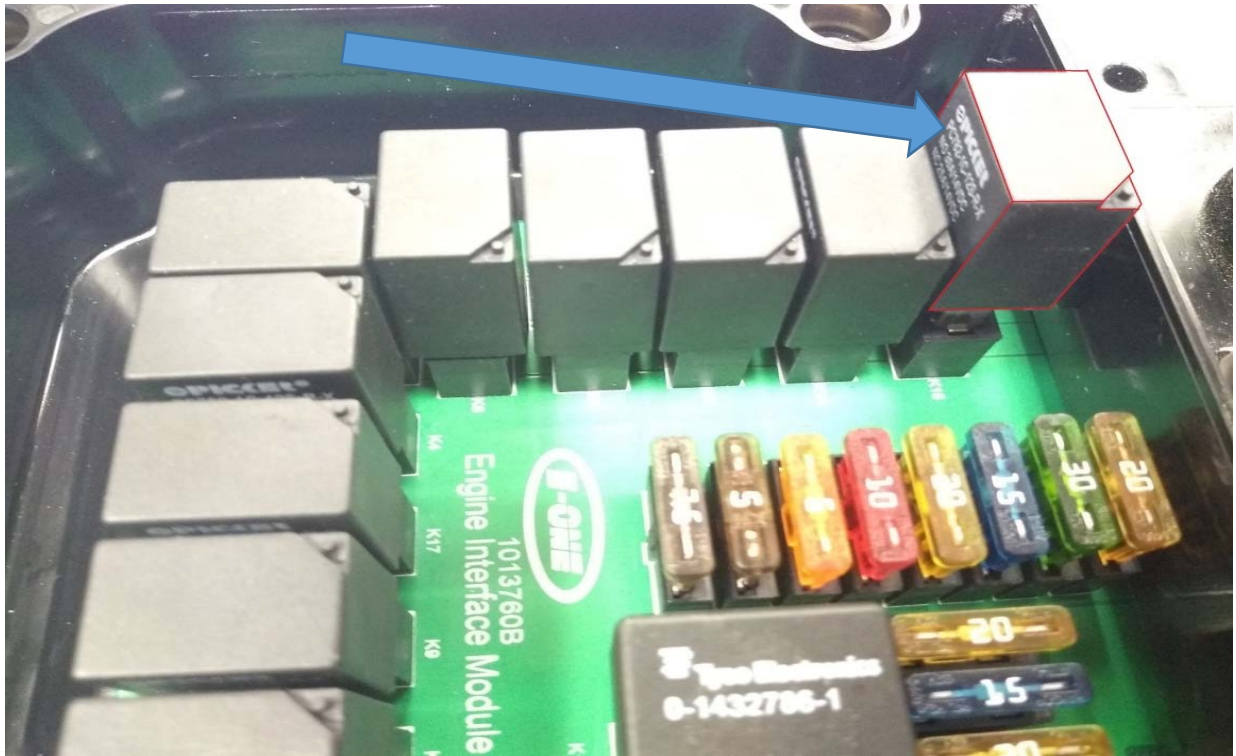
Figure 2 – Remove relay K-15 from far right location

Identify the K-15 relay in the top right corner. Additionally there is a label printed on the relay board. Pull Relay K-15 from the relay base using a back and forth rocking motion.