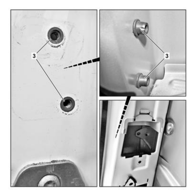
Figure 2: D72.10-A005-12