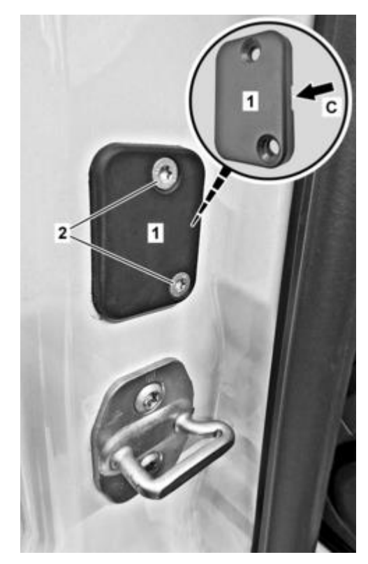
Figure 1: D72.10-A004-03

Shown on model 907.6, right side of vehicle