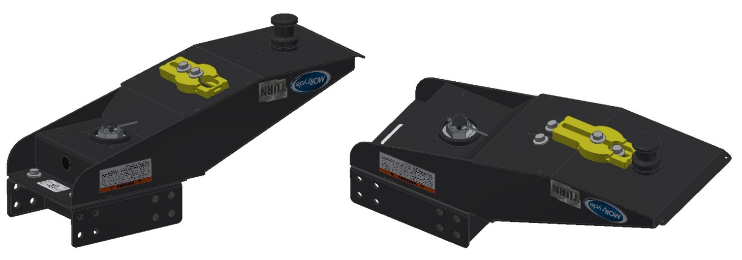
Standard wedge shown in yellow in storage location on You Turn Rotating Pin Box.

*Note: This recall only pertains to customers who are using the standard wedge that came with the rotating pin box or have it in the storage position. There is a separate recall if a different wedge kit has been installed.