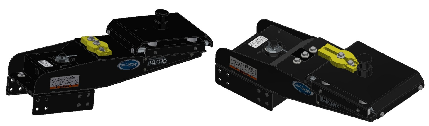
Standard wedge shown in yellow in storage location on Orbital Rotating Rubber Pin Box with 3 bolts installed.