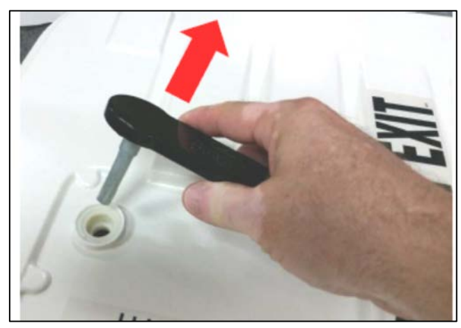
Figure 4: Removing the Exterior Hatch Handle