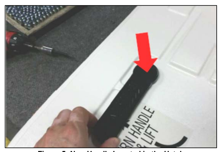
Figure 5: New Handle Inserted in the Hatch