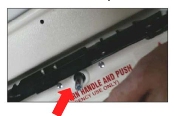
Figure 6: Handle Stem through the Interior of the Hatch

5. From inside the lid, locate the shaft of the outer handle. See Figure 6.