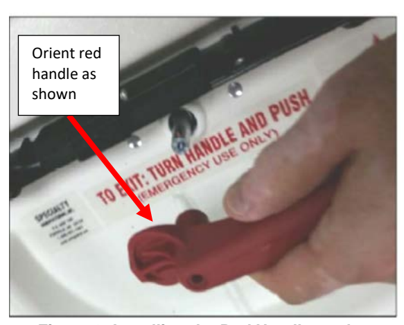
Figure 8: Installing the Red Handle on the Interior of the Hatch

7. From inside the bus, place the red handle on the stem of the external handle. Orient as shown in Figure 8.