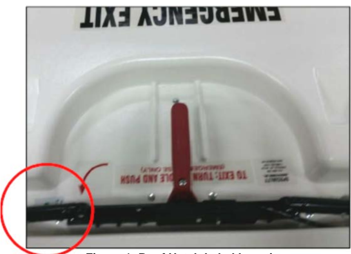
Figure 1: Roof Hatch Label Location

November 2019 FL819AB NHTSA#19V-549 (Non-School Buses) #19V-550 (School Buses) Transport Canada #2019-363 (Non-School Buses) #2019-362 (School Buses)