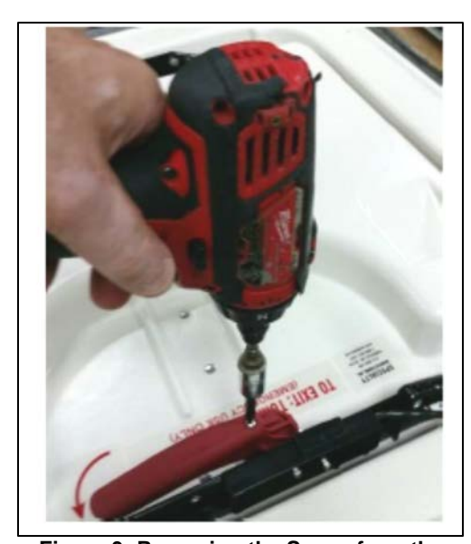
Figure 3: Removing the Screw from the Red Handle

1. Remove the screw from the red handle. Set the handle aside for reinstallation and discard the screw. See Figure 3 . Use a cordless drill with a 1/8-inch Allen bit, and the torque set to approximately 4-5.