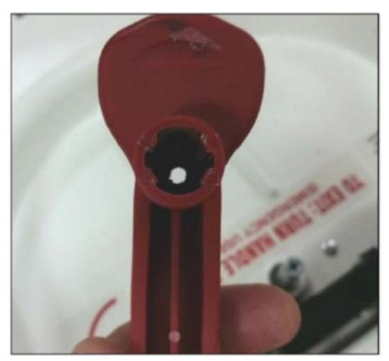
Figure 7: Ribs Inside the Red Interior Handle that Self-Orient

6. The red handle, removed earlier, has ribs to self-orient the handle when reinstalled with the black handle. See Figure 7 .