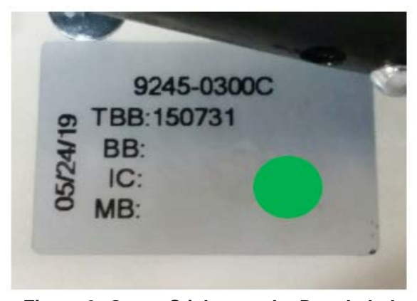
Figure 9: Green Sticker on the Data Label