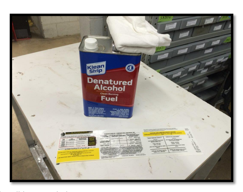
Labels will be provided