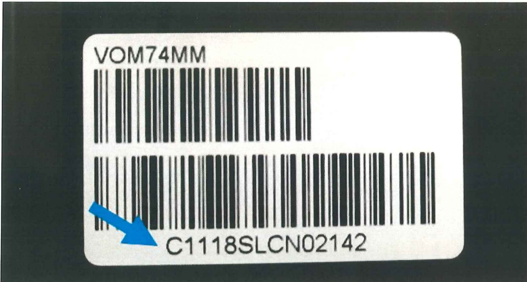
Front of Monitor

The serial numbers associated with the mirror monitors start with an "A", "B", or "C".