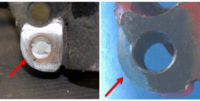
Figure 3 – Dent at the Loose Joint