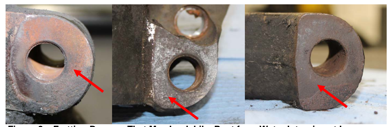
Figure 2 – Fretting Damage That May Look Like Rust from Water Intrusion at Loose Joint