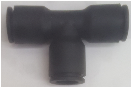
Figure 1: Non-DOT Approved Tee

If a plastic fitting is installed in the blue line and fails, loss of service brakes will occur, increasing the risk of a crash. Only the emergency braking system is available. If the plastic fitting is installed in the red line and fails, the emergency brakes activate, causing the trailer to stop unexpectedly and increasing the risk of a crash.