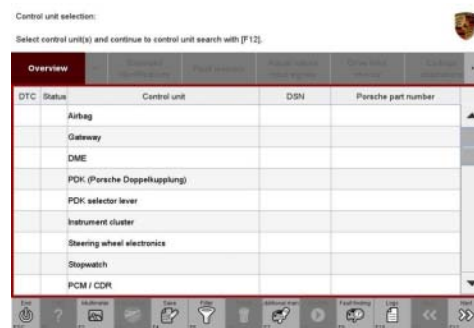
Control unit selection