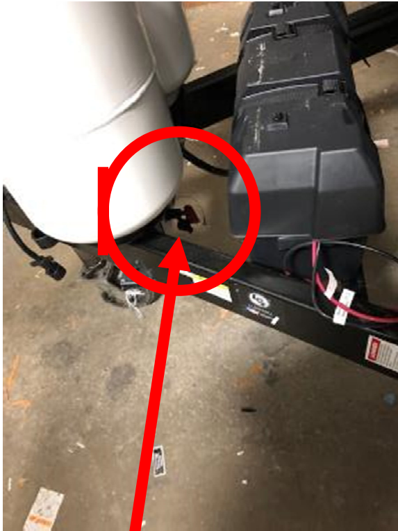
Location of battery disconnect