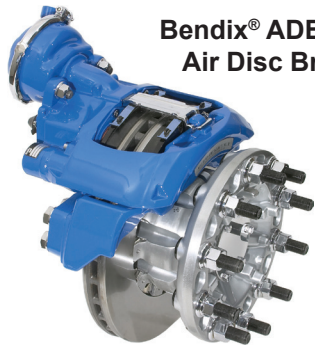
Bendix® ADB22X™ Air Disc Brake