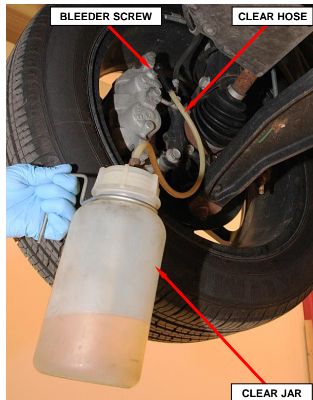
Figure 2 – Brake Bleeding Equipment