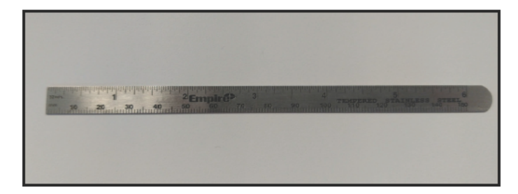
One (1) straight edged ruler -15cm or 6 inches (two types shown) PLASTIC is recommended to prevent any possible damage or scratching.