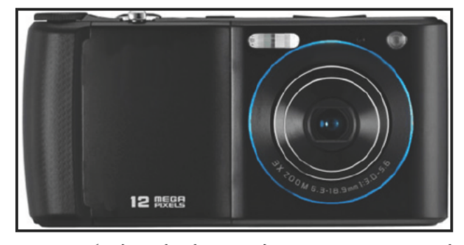
Camera or image capturing device such as a camera equipped mobile phone

Karma Automotive Bulletins and service documents are intended for use by experienced and trained Technicians. If you lack the skills, tools, equipment and a suitable workshop for any procedure described in this document, we suggest you leave such repairs to an Authorized Karma Service Provider or qualified service center. See your service provider for advice on whether your vehicle may benefit from the information contained within this document. The information contained in the Karma Bulletin is accurate at the date of publication. However, Karma Automotive regularly updates technical information. Please check with your Karma Automotive Service Provider that the bulletin you intend to use contains the latest available information.