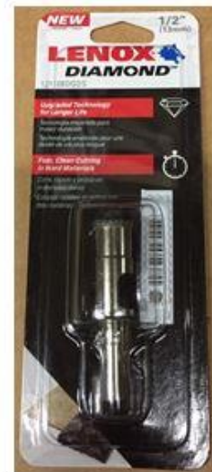
Tile Hole Saw