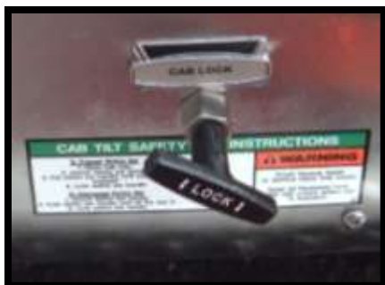
Figure 2 Cab Lock Control

The Cab Jack Remote Controls are on a tether that is inserted into an outlet located inside the passenger cab stepwell or on the front bumper. The Lock is located on the Discharge Panel on the passenger side. There are instructional stickers on the Discharge Panel or on the inside of the Control Box. When the cab is fully up, use the safety bar lock.