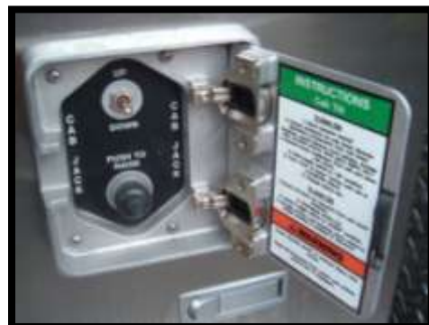
Figure 1 Cab Jack Controls