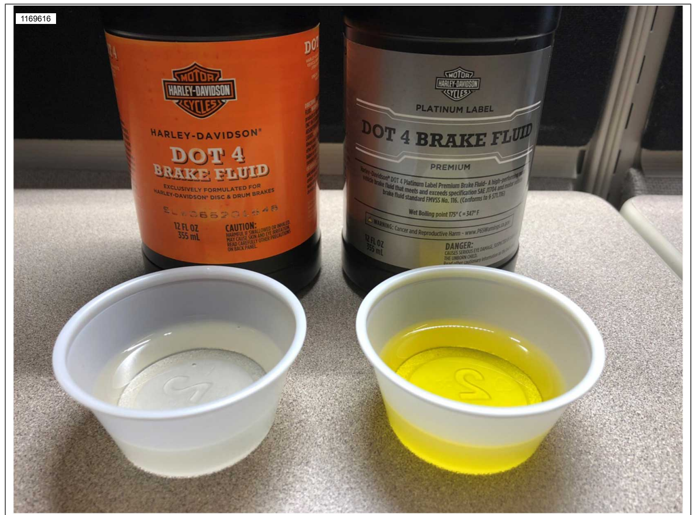
Figure 3. Dot 4 Brake Fluids

Refer to Figure 3. The difference in Platinum Label DOT 4 Brake Fluid chemistry will result in a noticeable color difference between the two fluids. The current DOT 4 BRAKE FLUID (41800219) is clear in color. The new fluid has a yellow tint to the fluid. Some may describe it as a yellow/green tint as well. These fluids are completely compatible and topping off one with the other, or slight mixing during the flushing process is not a problem.