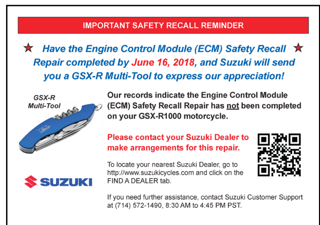
Reminder Postcard Side 2