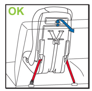
Lap belt with top tether.

You may be affected by the current recall. Call 1-855-215-4951