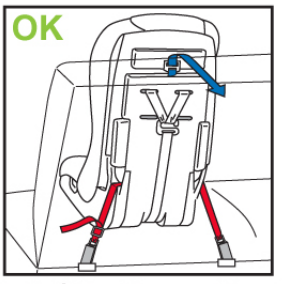
LATCH with or without top tether.

You are not affected by the current recall.