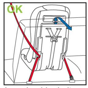
Lap-shoulder belt with or without top tether

You are not affected by the current recall.